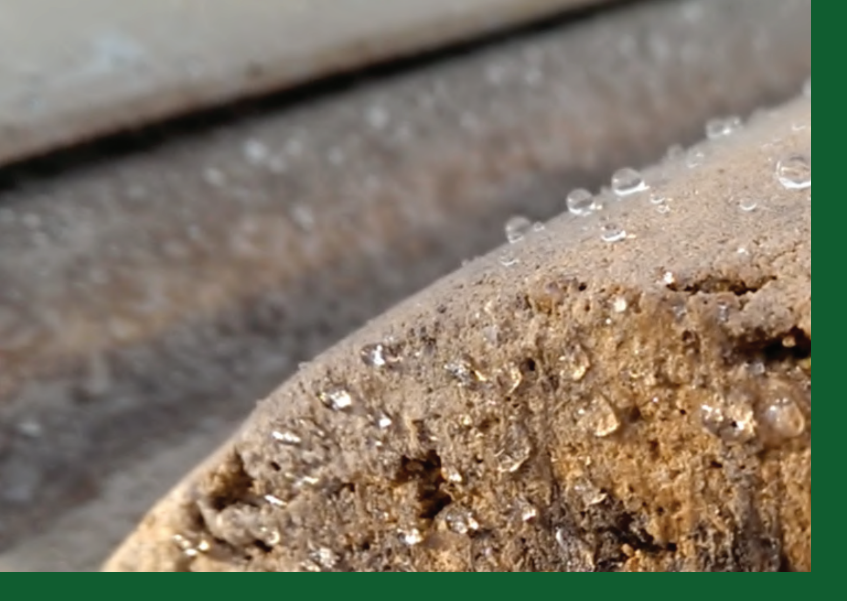
Protect your roof while maintaining the original, natural look of the tiles.